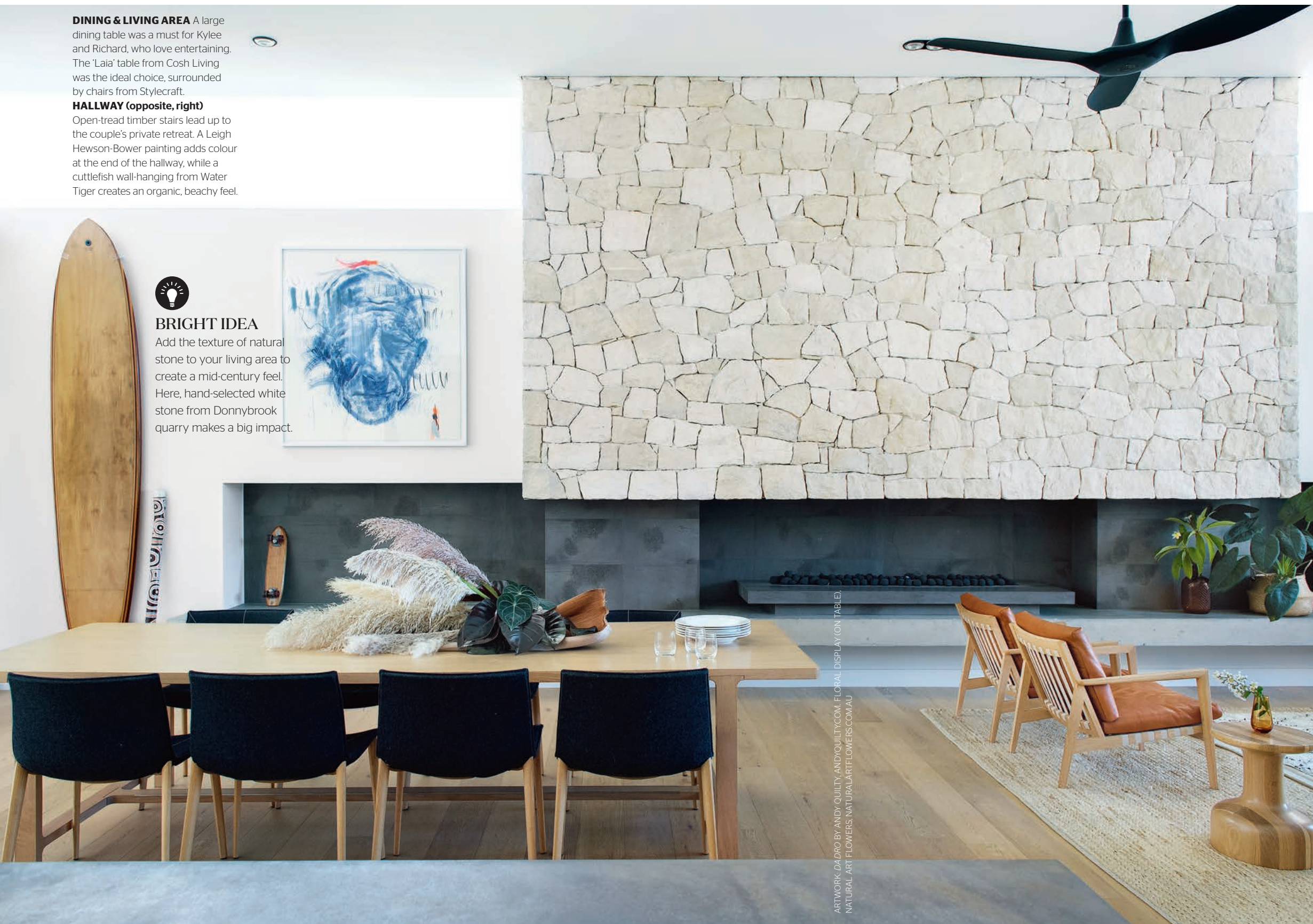
ARTWORK: DADRO BY ANDY OUILTY, ANDY OUILTY.COM; FLORAL DISPLAY: OK TABLE; NATURAL ART FLOWERS, NATURALARTFLOWERS.COM.AU

Add the texture of natural stone to your living area to create a mid-century feel. Here, hand-selected white stone from Donnybrook quarry makes a big impact.