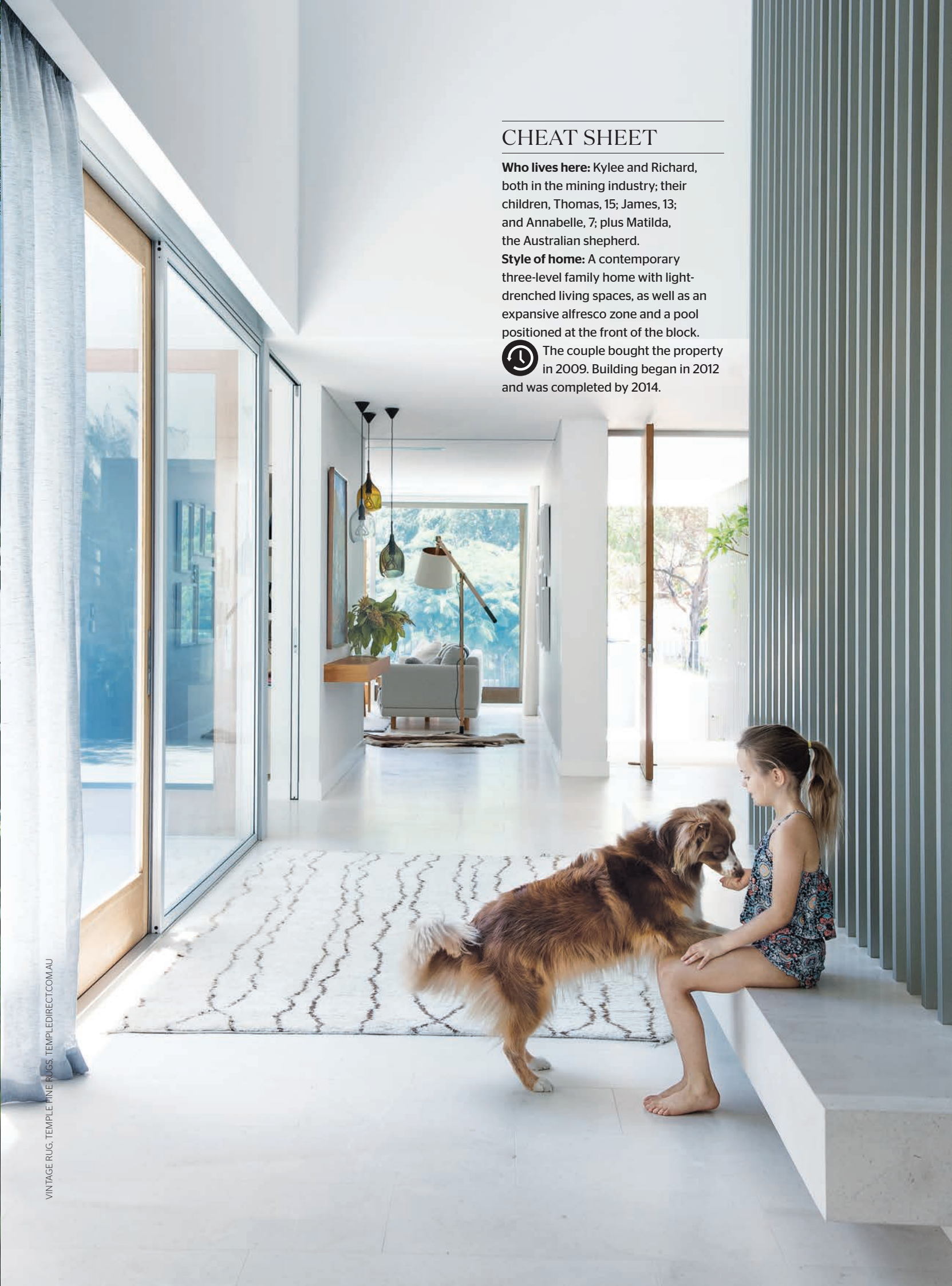
VINTAGE RUG, TEMPLE FINE RUGS, TEMPLEDIRECT.COM.AU